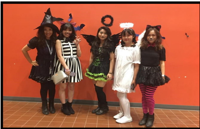
Club members and their advisor at the Halloween party