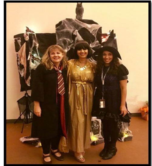
The ESL Club Advisors at the Halloween party.