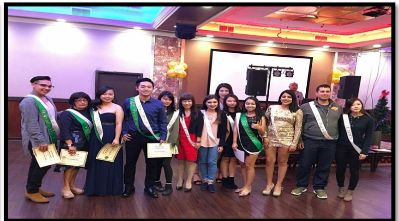
Spring 2018 Board Members at the fall banquet

Please join the ESL Club in Spring 2018.