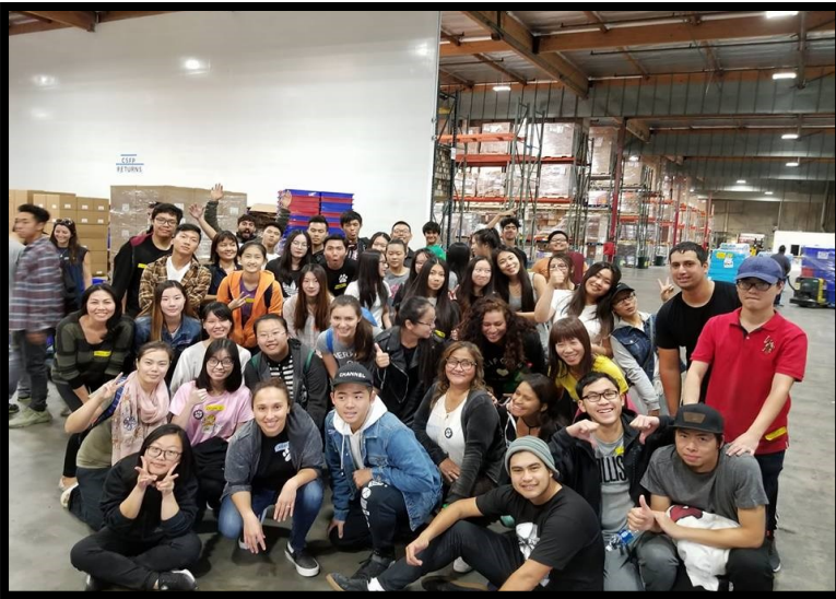
The ESL Club at the Los Angeles Food Bank

The ESL Club is one of the most active clubs on campus. Students make new friends and practice their English skills while engaging in fun activities. One activity that the club participated in this fall was to volunteer at the Los Angeles Food Bank to help their community. Students were excited to speak and work with native speakers of English there. In addition to volunteering, the Club hosted its first Halloween party. Students enjoyed dressing up in their costumes, and they danced with their family, friends, and professors. Club members feel more connected with the campus and their professors after participating in the club. ESL Credit and Noncredit students are welcomed to join.